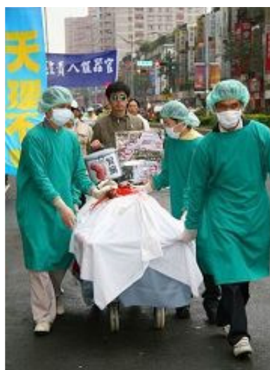
Reenactment to expose CCP atrocities of live organ removal