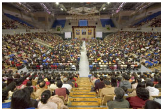
The conference hall

(Clearwisdom.net) On December 3, the 2006 Taiwan Falun Dafa Experience Sharing Conference was held in Hsinchuang Stadium, Taipei County, Taiwan. More than 7,000 practitioners from Taiwan, North America, Japan, Korea, Singapore, Malaysia and Saipan Island attended the conference. Twenty-one practitioners, including college professors, graduate students, school teachers, military officers, housewives, and high school students, shared their experiences in cultivation.