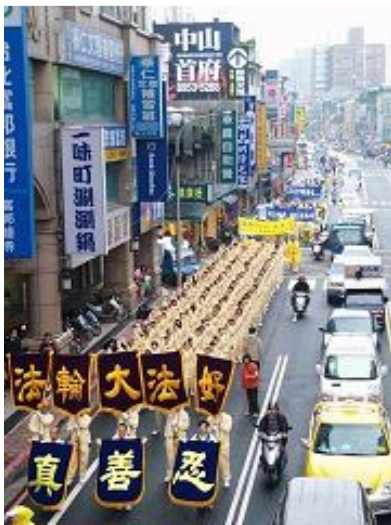
More than seven thousand people rallied at Panchiao Municipal Stadium, Taipei County and participate in grand march

(Clearwisdom.net) On December 2, 2006, several thousand Falun Gong practitioners from Taiwan, Japan, Korea, Hong Kong and Singapore held a rally at Panchiao Municipal Stadium and participated in a grand march. The theme of the march was to support 16 million Chinese people quitting the Chinese Communist Party (CCP) and its affiliated organizations and to expose the CCP's atrocities of organ removal from living Falun Gong practitioners for profit.